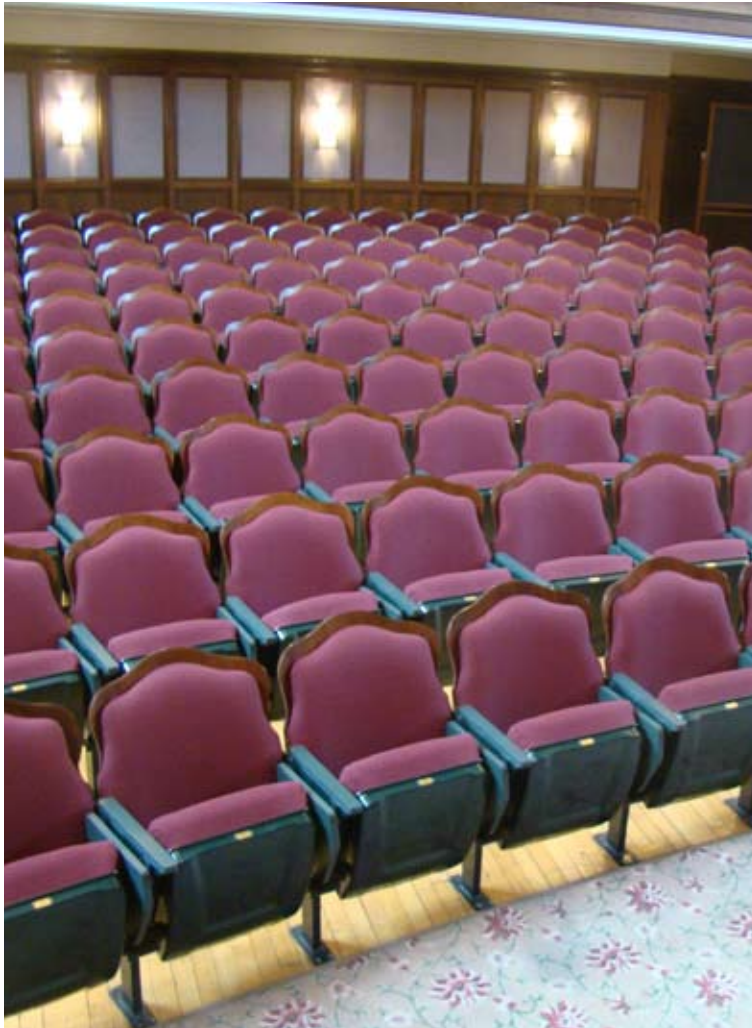
Yale University, New Haven, CT Whitney Humanities Center