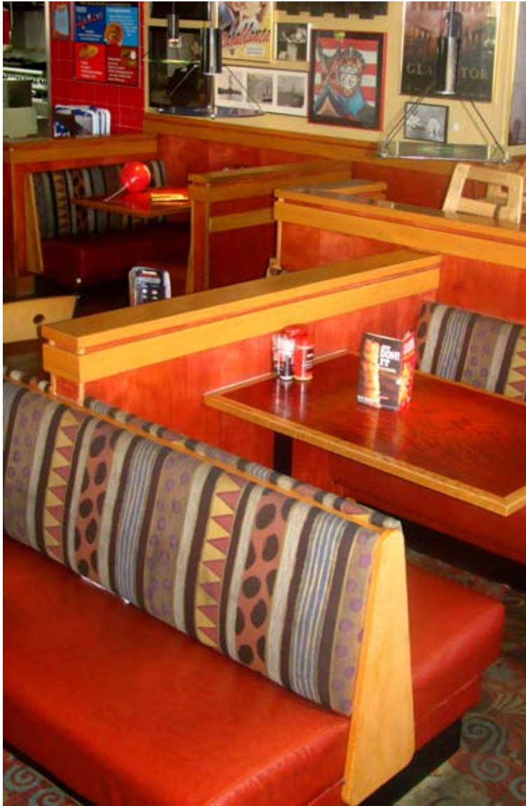
Red Robin of Manchester